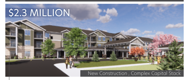
The Sycamore of River Hills: Equity Requirements Reduced with PACE Equity in the Capital Stack