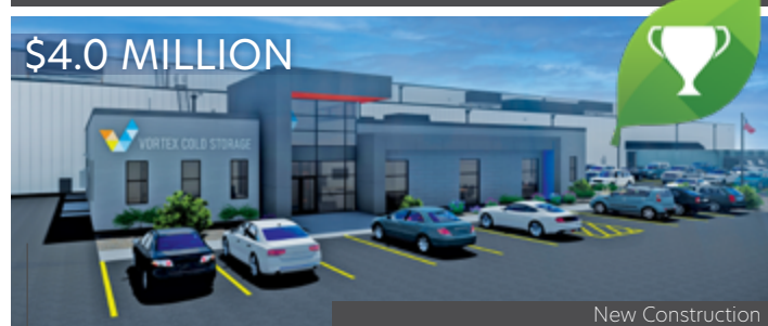
PACE Equity Wins Environmental Impact Award for Recent Industrial Project: Vortex Cold Storage Saves 32,000 MT of Carbon Emissions