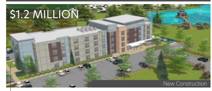
TownePlace Suites by Marriott Hotel: Lower WACC and Reduced Equity Requirements