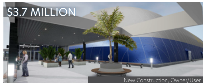
Hall of Fame Village Center for Performance: Repeat Funding for Projects in the Tourism Development District